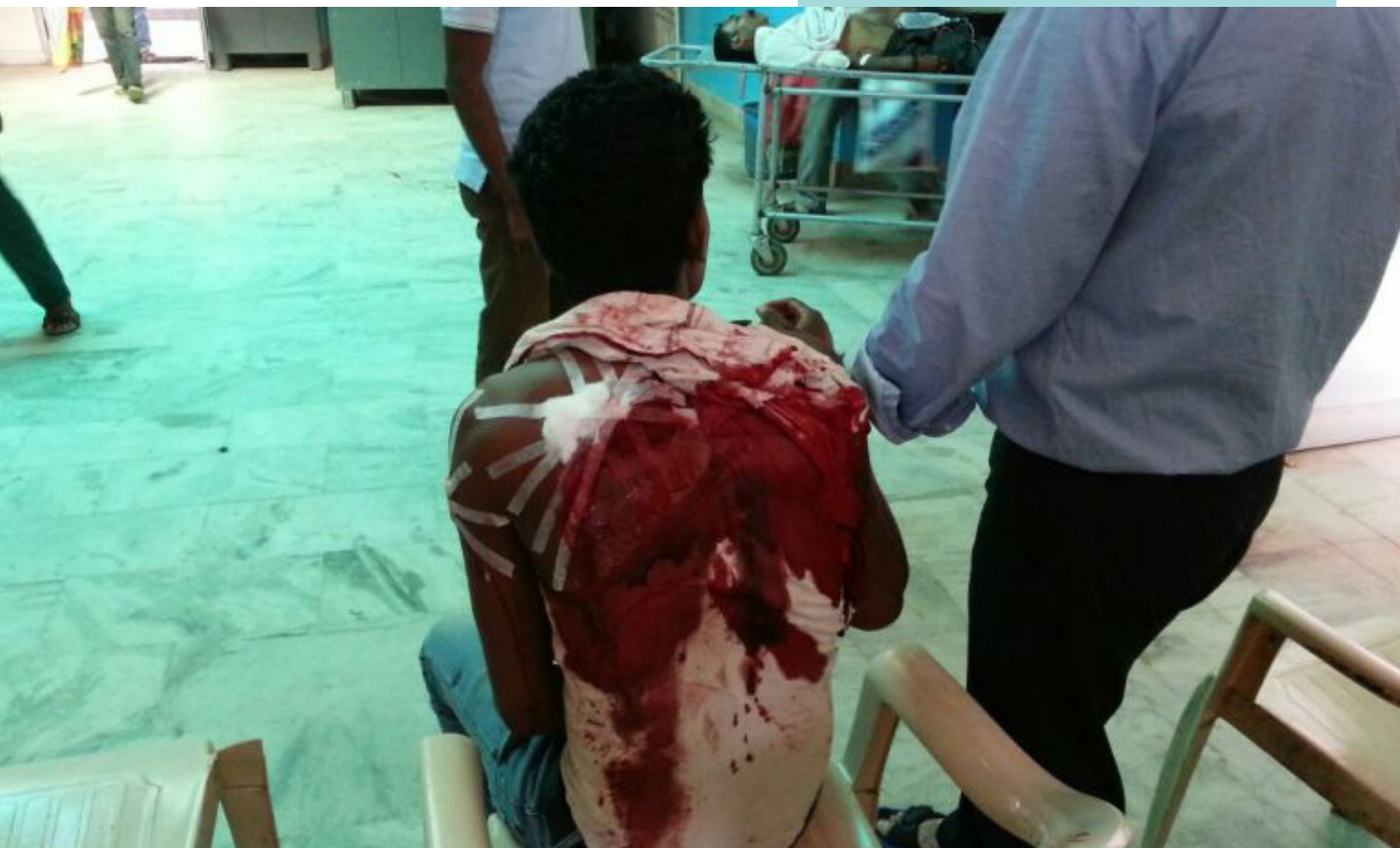
Five people were killed and at least 15 were seriously wounded when police opened fire on protestors opposed to a coal-mining project owned by NTPC Limited in Jharkhand state.

Track Record: NHPC's dams have reportedly displaced hundreds of thousands of Indian farmers, fishers, and indigenous people. The