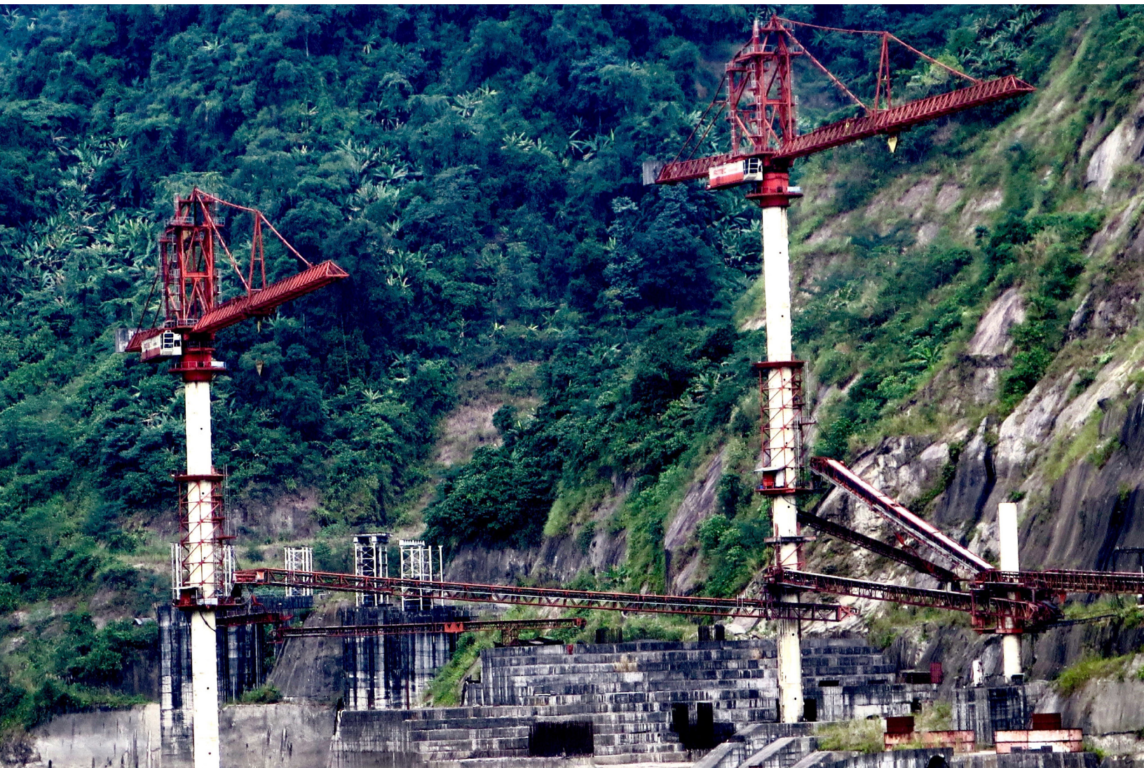
NHPC's planned Lower Subansiri project, which is being built in the Himalayan foothills, threatens the area's delicate biodiversity and the livelihoods of indigenous communities.

NHPC owns, either outright or through joint ventures, nearly two dozen large dams in India, with a number of others planned or being constructed. These dams have displaced hundreds of thousands of people, damaged crucial waterways and biodiversity, and provided few benefits to the people living near them. In many cases, communities affected by these projects have resisted their development. Regardless, NHPC has pressed forward, indifferent to the outcry.