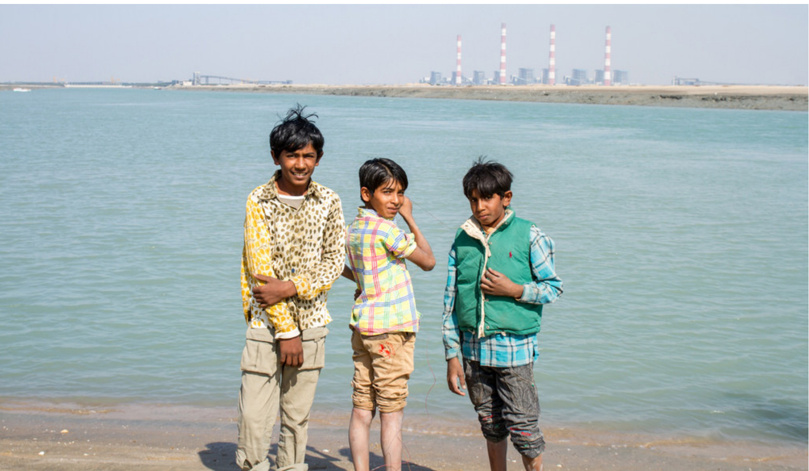
The Mundra complex, located in Gujarat state, includes a coal plant, port and special economic zone. It has polluted the ocean and displaced local fishing families. The IFC's commercial bank clients financed both the complex and the company that owns it, Adani.

financing from the IFC has instead received those funds through back channels.