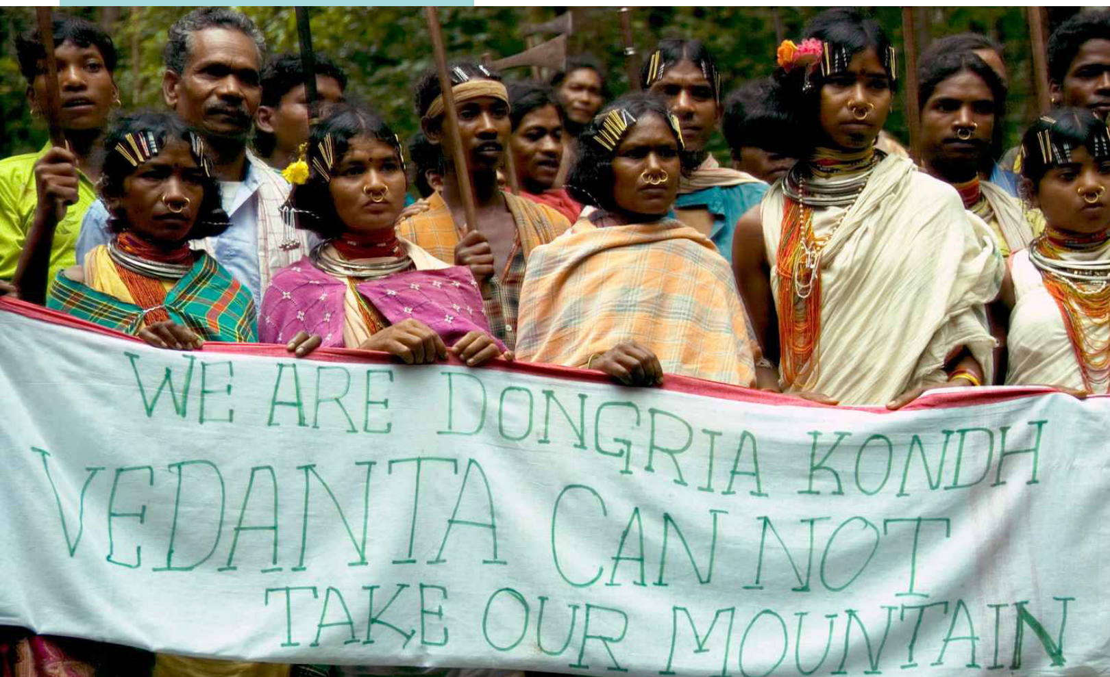
Members of the indigenous Dongria Kondh tribe demonstrate against a planned bauxite mine in the sacred Niyamgiri hills. The project by Vedanta Resources was ultimately stopped, in a landmark victory for tribal rights in India.

Even more troubling, the IFC's financial-sector clients have financed companies with well-documented track records of complicity in grave human rights abuses and environmental degradation.