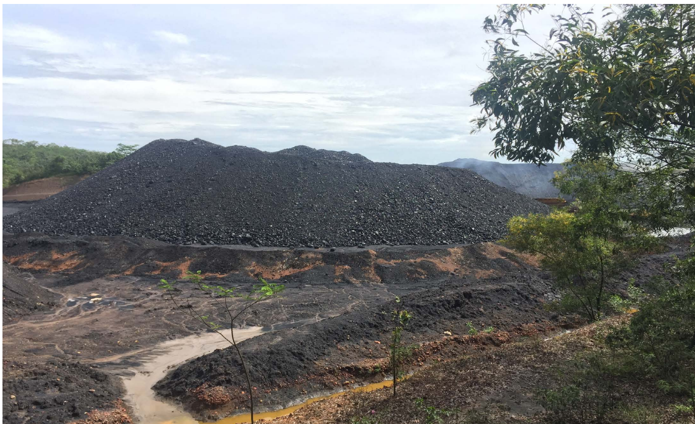
The IFC recently announced new policies designed to cut off its support for coal. Civil society groups have welcomed the move but say the policies are only as effective as their implementation.

If Indonesia illustrates the extent of the IFC’s coal problem, it also offers an opportunity to