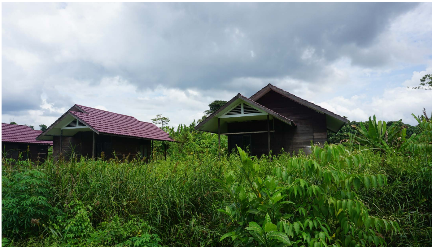
Kaltim Prima Coal built a resettlement site for villagers it seeks to displace. But few residents were able to make ends meet there. The resettlement site is now largely abandoned.