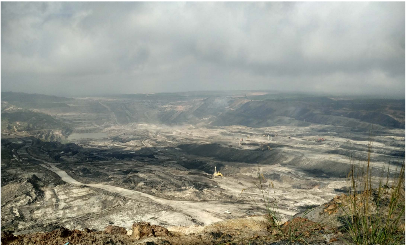
Approximately 43% percent of the surface area of East Kalimantan, an Indonesian province on Borneo, has been handed over to mining companies, according to JATAM, a Jakarta-based coal watchdog.