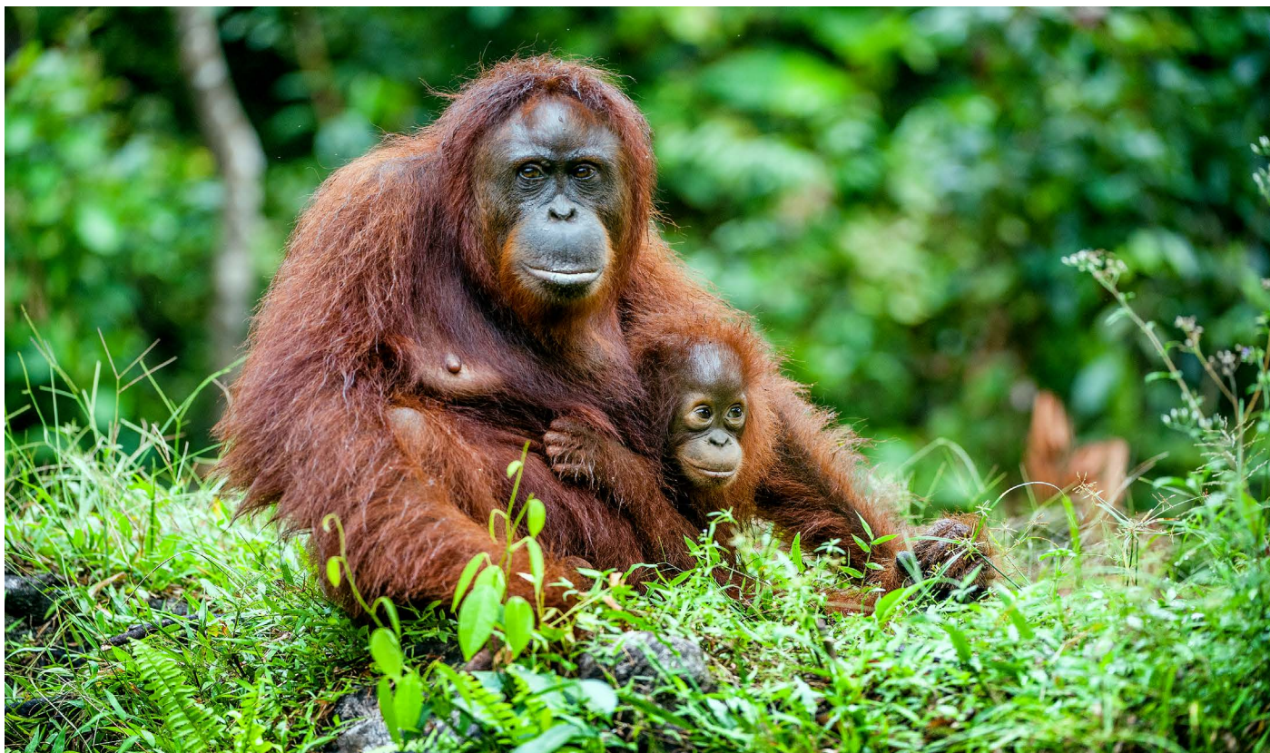
Coal mining threatens Indonesian Borneo's globally important biodiversity, including its endangered population of orangutans.

emitter , ahead of Brazil, according to European Commission data.