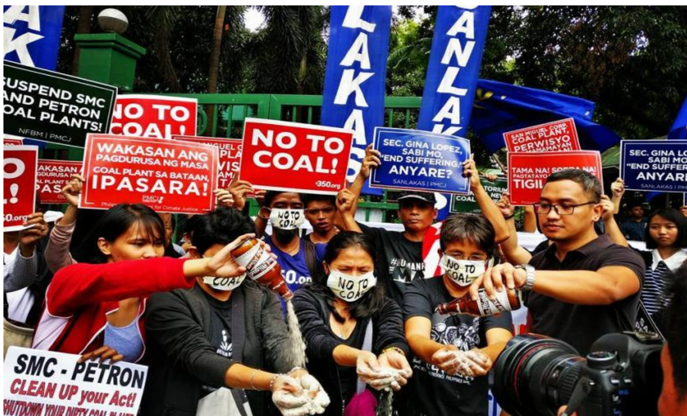
The IFC's financial intermediary lending has exposed the World Bank Group to coal projects around the world, including in the Philippines, where public opposition to new coal plants is strong.

financial-sector portfolio are systemic and run deep. A few years ago, the issue was not fully understood by the public, which knew of only a handful of cases in which IFC was exposed to companies that were causing harm to people or the environment through financial intermediaries.